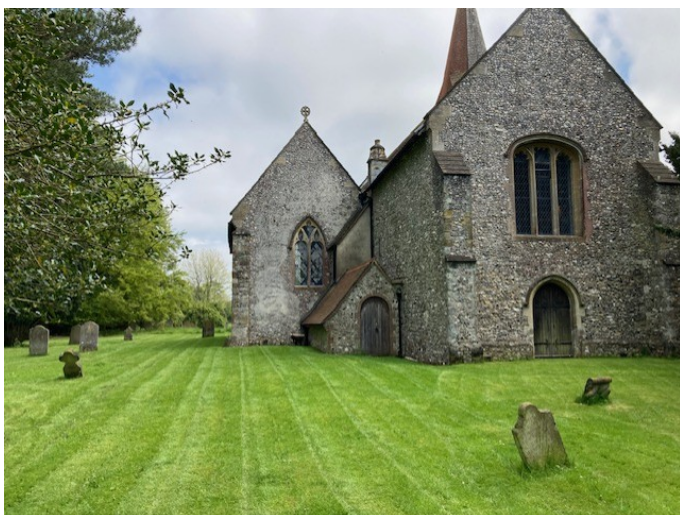
St Peter & St Paul, Cudham