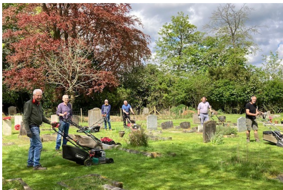
Cudham Churchyard working party

Both parishes have a graveyard or cemetery. St Mary's churchyard is closed and the current cemetery is in High Elms Road. The churchyard of St Peter and St Paul was extended in the 1930s by adding a section of the adjacent Recreation Ground and includes several Commonwealth War Graves. Volunteers at Cudham maintain their church grounds by monthly churchyard working parties, whereas responsibility for the land around St Mary's now lies with Bromley council and a contractor maintains the cemetery.