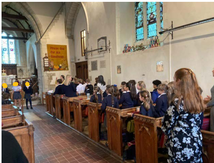
Cudham CE Primary School service

Both parishes have Village Primary Schools, currently with 50-60 children at each. Cudham CE Primary School is located about a mile from the church and is an academy within the Aquinas Church of England Trust. Downe Primary School, a Pioneer Academy school, is within walking distance of St Mary's Church. We are involved in leading the Collective Worship on a weekly basis at both schools and preparing and organising their Harvest, Christmas, Easter and end of school year services in the respective churches.