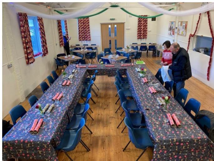
Cudham Parish Hall

Both parishes have halls, indeed Cudham has two - the Parish Hall (originally the Church Hall) in Cudham Lane South and the Eldon Hall on the Hazelwood Estate in Cudham Lane North. Downe's is the old village school, donated by the Lubbock family, and is across the road to the church. All are run by trustees and are well used for a variety of private and community events, and each has an interesting history.