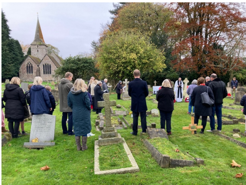
Remembrance Sunday in Cudham