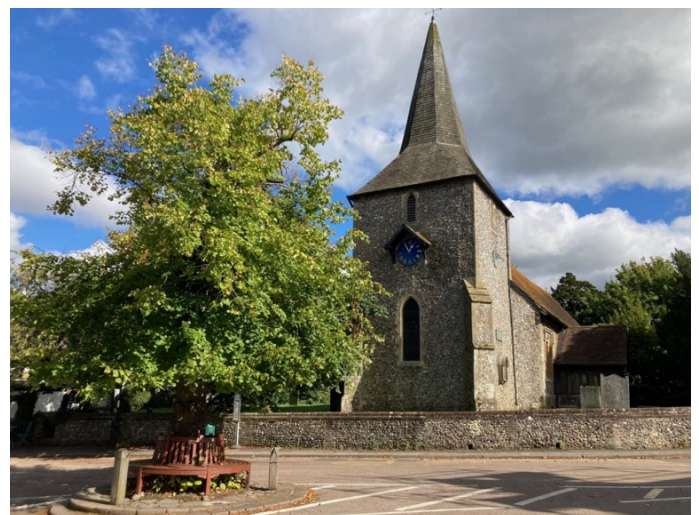
St Mary's, Downe

Both buildings are generally in good order. Cudham's next quinquennial Inspection is due in 2027, Downe's in 2028.