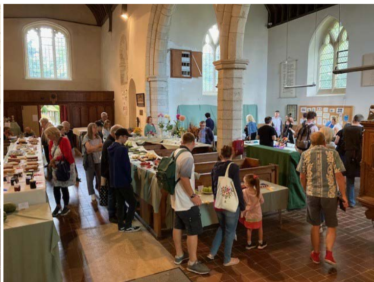
Bank Holiday Show in Cudham