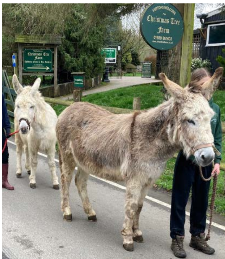
Palm Sunday in Downe