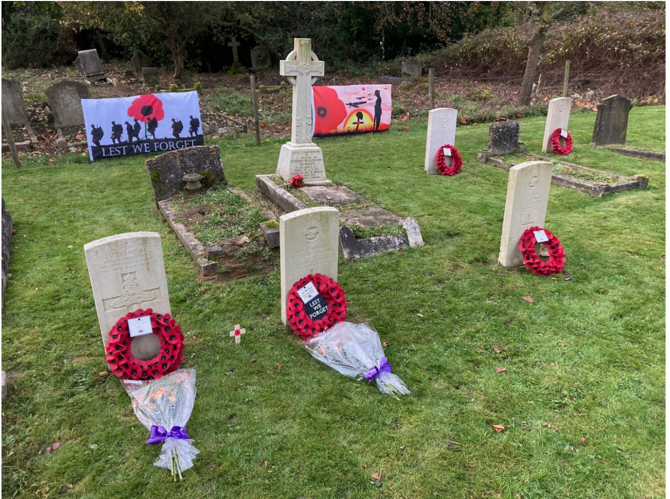
Commonwealth War Graves, Cudham