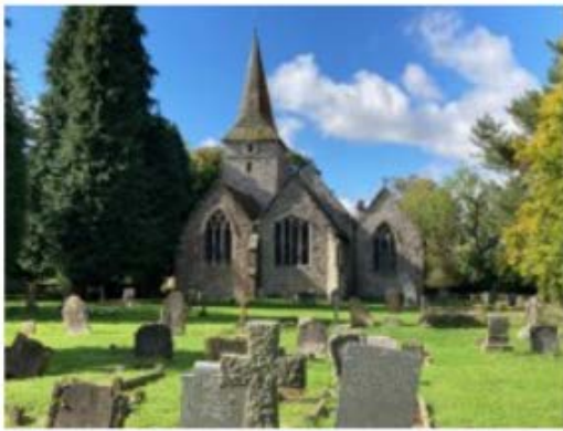
St Peter & St Paul, Cudham