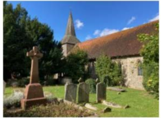
St Mary's, Downe

Rural communities within the London Borough of Bromley