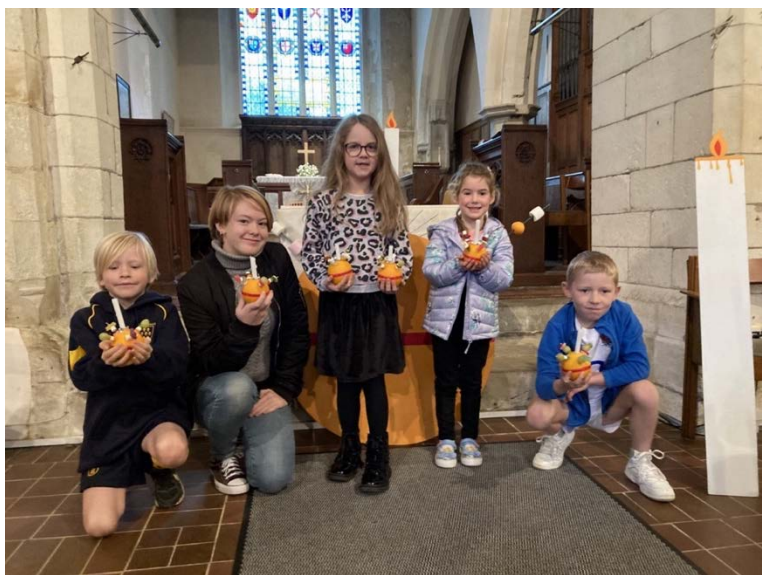
Christingle Service in Cudham Church