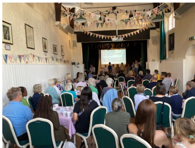
Downe Village Hall

Both parishes have a graveyard or cemetery. St Mary's churchyard is closed and the current cemetery is in High Elms Road. The churchyard of St Peter and St Paul was extended in the 1930s by adding a section of the adjacent Recreation Ground and includes several Commonwealth War Graves. Volunteers at Cudham maintain their church grounds by monthly churchyard working parties, whereas responsibility for the land around St Mary's now lies with Bromley council and a contractor maintains the cemetery.