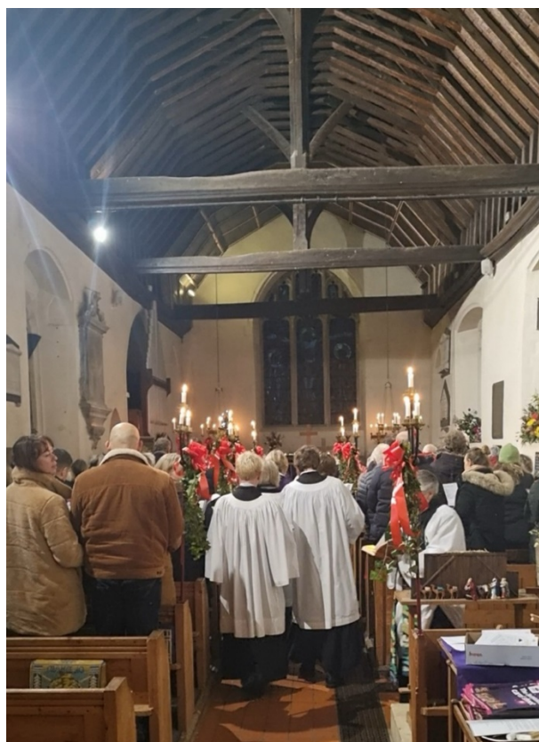
Carol service in Downe