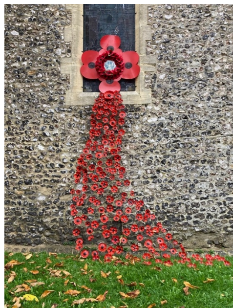
Downe poppy display